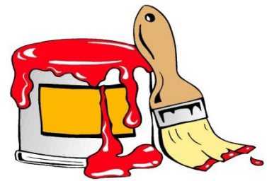
3. Paint – Strong